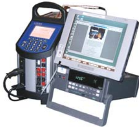
XpertVal 21 channels

XpertVal was designed for simplifying validation jobs versus the existing validation systems; In compliance with FDA and European regulation, this system uses the most recent technology and the most powerful software enhancements. Reports are generated automatically and data integrity complies with FDA 21 CFR Part 11