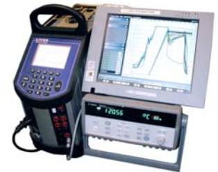
XpertVal 60 channels

XpertVal was designed for simplifying validation jobs versus the existing validation systems; In compliance with FDA and European regulation, this system uses the most recent technology and the most powerful software enhancements. Reports are generated automatically and data integrity complies with FDA 21 CFR Part 11